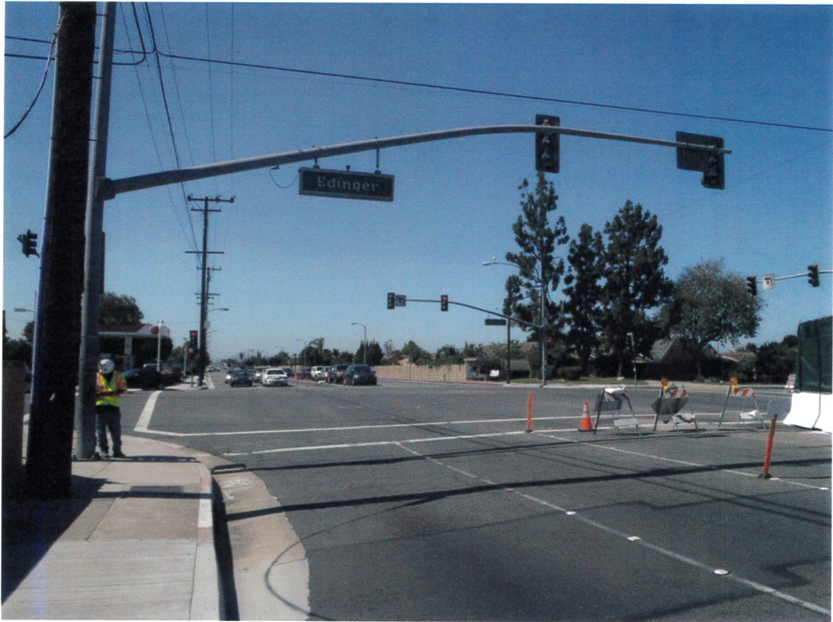
Photo No. 1 Deck View looking South.