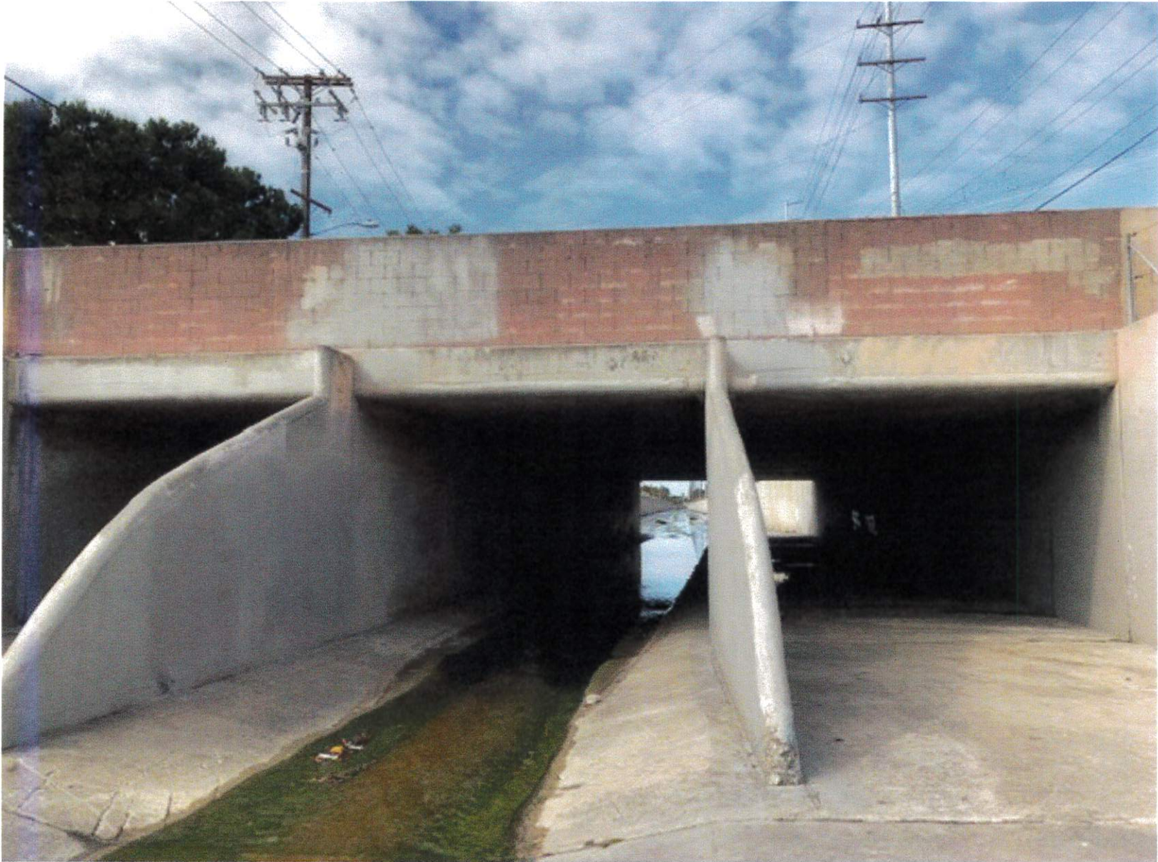
Photo No. 1 Elevation looking west