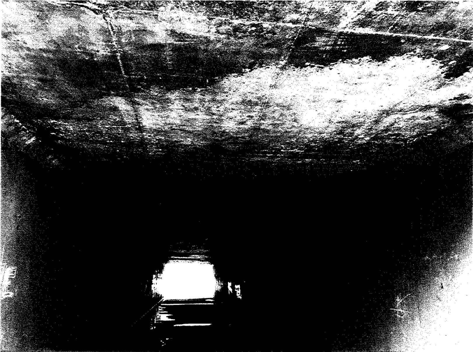
Photo No. 1 Transverse cracks with efflorescence inside Box 2 Soffit